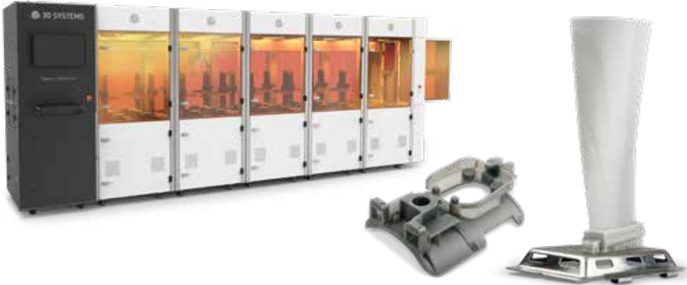
Figure 4 Production packages the design flexibility of additive manufacturing in configurable, in-line production modules to deliver a customizable and automated direct 3D production solution. Features like automated material delivery and integrated post-processing reduce hands-on processes to streamline operations and lower total ownership costs.

Industry's first scalable, fully-integrated factory solution for direct 3D production