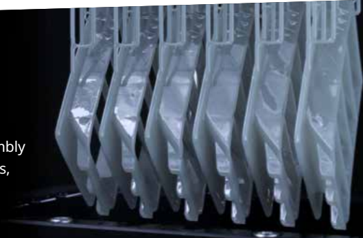
Figure 4™ delivers ultra-fast additive manufacturing technology in discrete cells, allowing it to be placed into automated assembly lines and integrated with secondary processes, including washing, drying and curing.