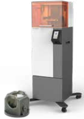
Figure 4 Standalone is an affordable and versatile solution for low volume production, and fast prototyping in the tens and hundreds of parts per month. Figure 4 Standalone offers quality and accuracy with industrial-grade durability, service and support.

Affordable industrial-grade solution for lower cost production parts